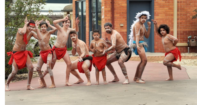
Photo 2: Wimmera dance group Wotjobaluk dancing at the community day in Weir park for NAIDOC celebrations.