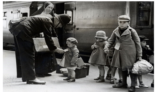
2009 WW2 children evacuees reunite 70 years later 2nd September 2009